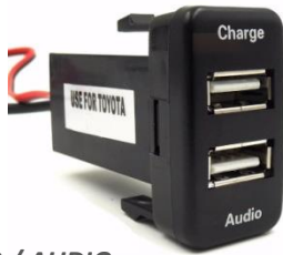
USB / AUDIO